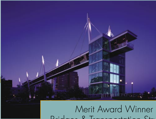
Merit Award Winner Bridges & Transportation Structures