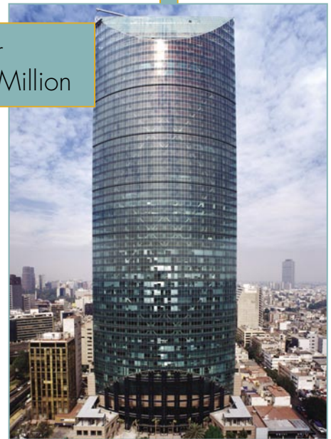
Merit Award Winner New Buildings Over $30 Million

A series of structural analyses were performed to establish the influence of various supplemental damping devices in the performance of the tower. A parallel research study was also conducted by WSP Cantor Seinuk to investigate the optimal utilization of dampers. These investigations allowed for the formulation of a unique application of viscous damping elements into the structure.