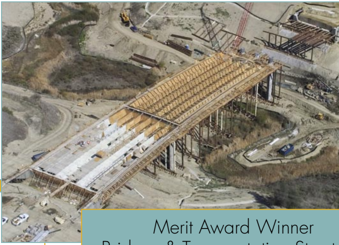
Merit Award Winner Bridges & Transportation Structures

Talega Bridges San Clemente, CA RDF Consulting