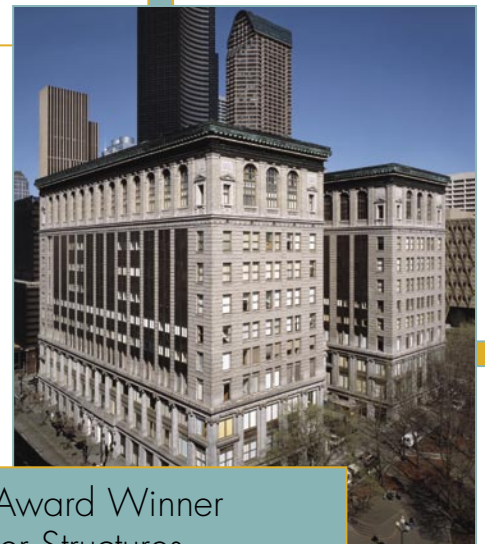
Merit Award Winner Other Structures

To provide significant strength and stiffness in the east-west direction, six bays on each floor received diagonal buckling-restrained-braced-frames. Retrofits in the north-south direction were designed to work in conjunction with the existing frames. To reduce building displacements without significantly stiffening the building, viscous dampers were added at six bay per floor. In addition, several bays on each floor were retrofitted using hybrid steel-fiber-reinforced-concrete beam frames.