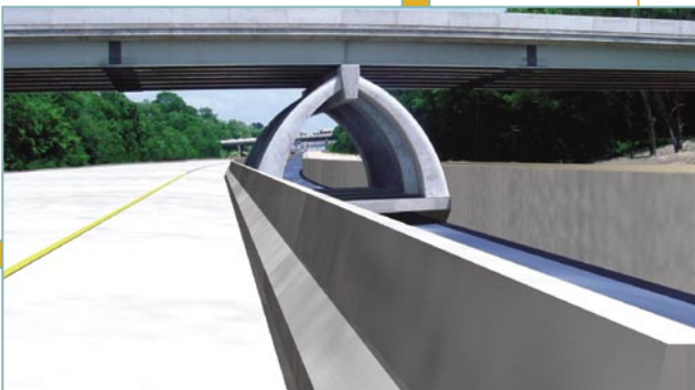
Merit Award Winner Bridges & Transportation Structures

The new bridges have several innovative features. The proposed roadway was positioned immediately adjacent to the existing flume due to right-of-way restrictions. The adoption of the tied-arch pier facilitated the incorporation of a support for the bridges in the center of the facility while simultaneously spanning the flume. The foundation for the pier consists of steel piles driven on either side of the flume. The concrete pile caps serve as the support for the tension tie member that spans the flume. The tie member not only serves to tie the arch but it also supports it and transfers the vertical loads to the pile bents. The result is a support that does not encumber the roadway or create an obstacle in the flume.